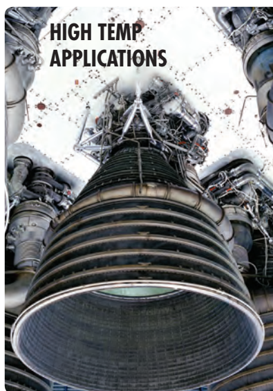
HIGH TEMP APPLICATIONS

Please call us at 800-348-6268 with your form and size requirements. No order is too small.